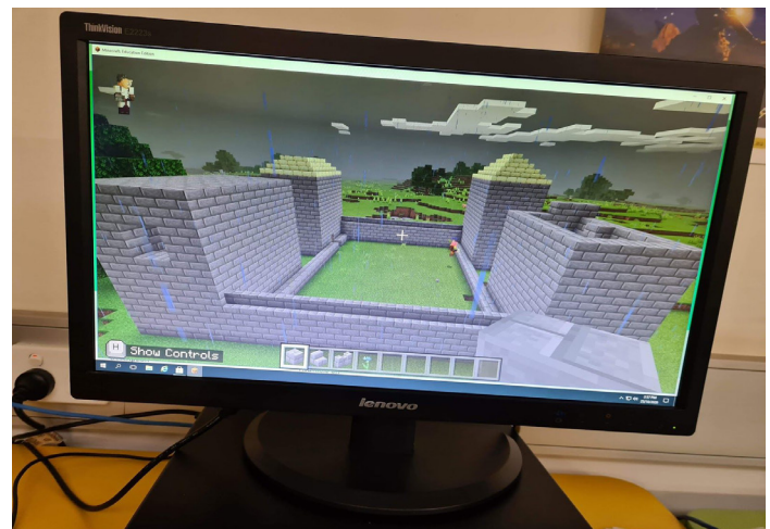
Modifying existing designs to create something new