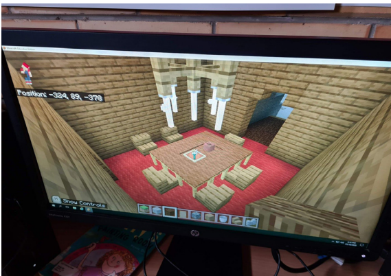
Creating formal dining areas for entertaining at Court

Some classes have even been taking their knowledge to new platforms, with 7K on the Griffith site turning to Minecraft to recreate some of the architecture likely to be found during the Medieval period. The students have become incredibly engaged with this, discussing the size of crenellations required to protect from a variety of different weaponry and the different rooms needed to fulfil the variety of roles of a castle.