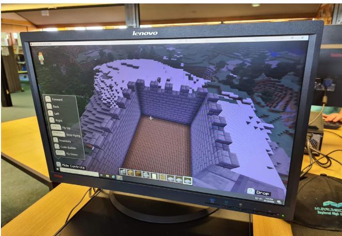
Utilising the landscape to assist defences

Some classes have even been taking their knowledge to new platforms, with 7K on the Griffith site turning to Minecraft to recreate some of the architecture likely to be found during the Medieval period. The students have become incredibly engaged with this, discussing the size of crenellations required to protect from a variety of different weaponry and the different rooms needed to fulfil the variety of roles of a castle.