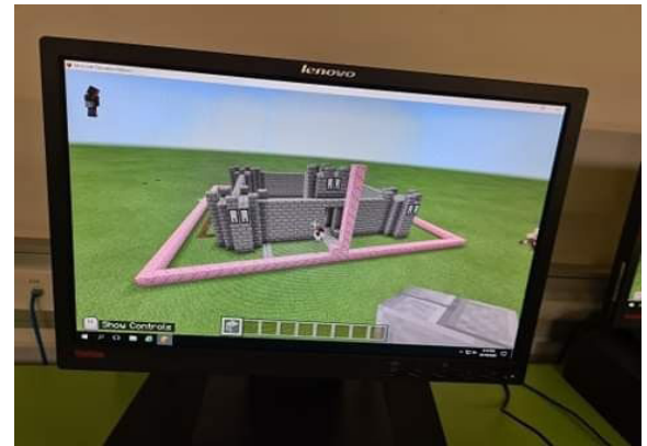
Building defences to protect the Castle

Yr 7 Quest classes are currently expanding their knowledge of key concepts in English and History, grounding the skills of humour, wit and timing in the historical period of the Middle Ages. With such a wide swathe of popular film excerpts such as Monty Python's Black Knight scene as well as Princess Bride, students will access a wide variety of examples to help them along their journey.