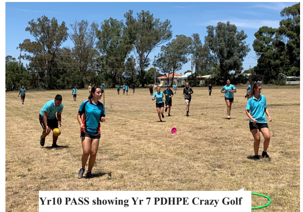
Yr10 PASS showing Yr 7 PDHPE Crazy Golf

The Yr 9 cohort have been studying the Safety First Unit of work, which includes learning about bullying, managing risk and online dangers. In practical lessons, they have enjoyed playing sports that can be done for leisure or have a cultural focus. This includes the indigenous game Buroinjin (a favourite amongst students), Bocce and Touch. Yr 10 have been working through the My Unique Self Unit in theory lessons, learning about what shapes an individual and how to overcome future challenges they might face. In practical lessons, they have been participating in a range of new games such as Frisbee Golf and Pyramid Dodgeball. Yr 10 have also worked in groups to develop a new game of their own, which they then taught to their peers.