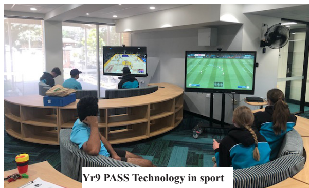
Yr9 PASS Technology in sport