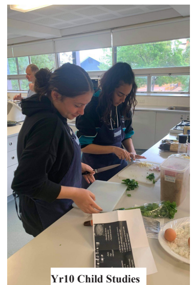
Yr10 Child Studies

The PDHPE Department would like to take this opportunity to wish all students and their families a safe and happy holidays.