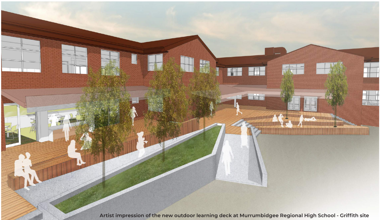
Artist impression of the new outdoor learning deck at Murrumbidgee Regional High School - Griffith site

School Infrastructure NSW Email: schoolinfrastructure@det.nsw.edu.au Phone: 1300 482 651 www.schoolinfrastructure.nsw.gov.au